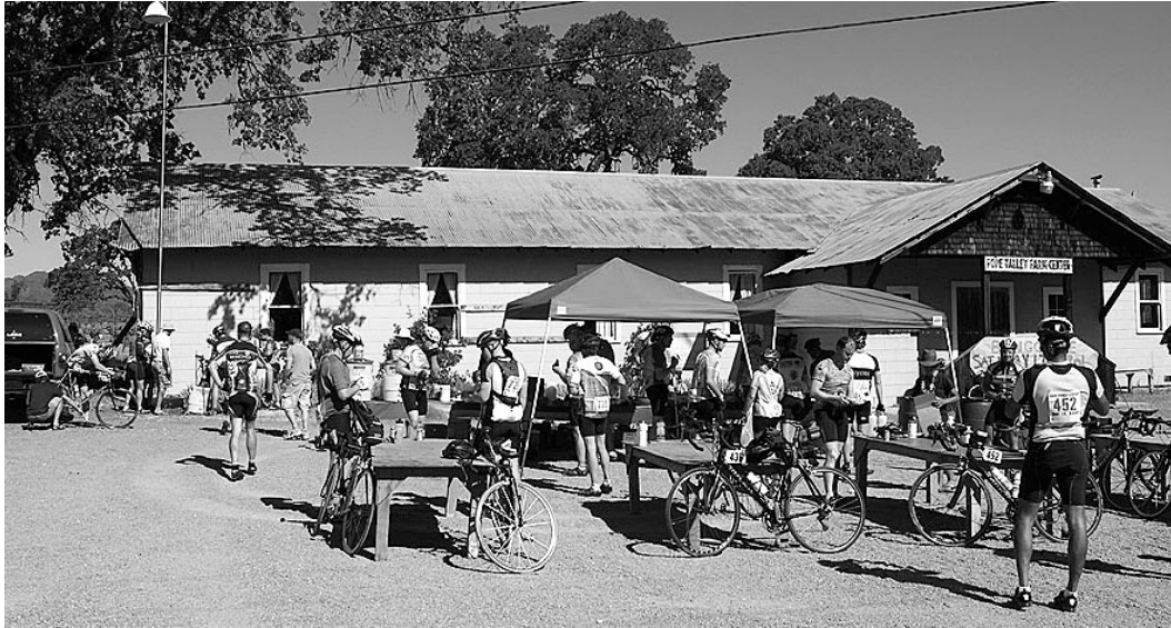
The Pope Valley rest stop, 2008.