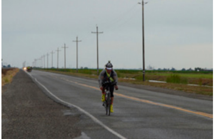
The GRR began under grim skies

I am indeed thankful for all these dedicated helpers. The GRR is