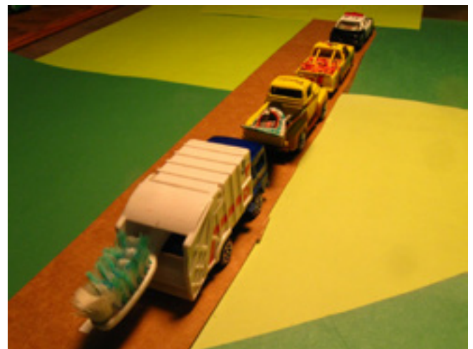
The TDF broom wagon brings up the rear behind law enforcement, Jelly Belly team support and Vamic neutral support

These images of race support vehicles on a dry run were captured by William White-head on local county roads, the day before the 2013 Tour de Fritter (TDF 4-IV).