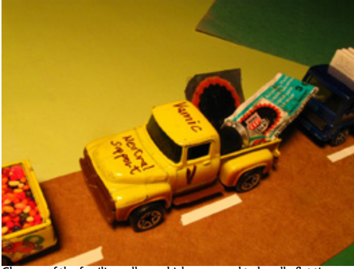
Closeup of the familiar yellow vehicle prepared to handle flat tires. At left, suspected high-energy low-fat cargo is visible in the bed of the Jelly Belly truck.