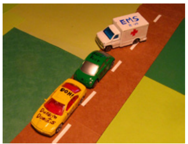
Two additional team cars were also seen. Shortly after this picture was taken, the ambulance departed the roadway for unknown reasons.