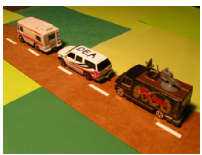
Minutes later, this unmarked motorhome was seen being followed by a US Government vehicle and a news crew.